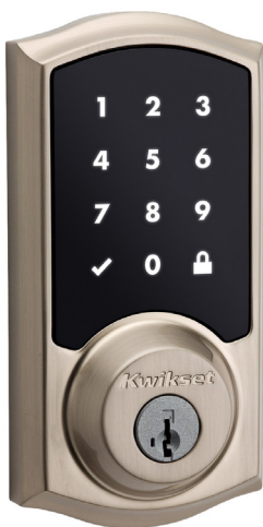
99160-020 916TRL ZW500 15 RCALFD Satin Nickel 15