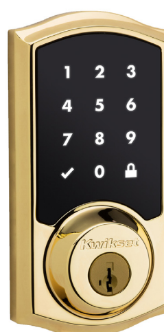
99160-019 916TRL ZW500 L03 RCALFD Polished Brass L03

FINISH AND LIFETIME WARRANTY MECHANICAL ONE YEAR ELECTRONIC WARRANTY