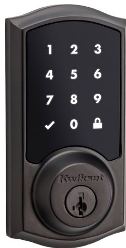
99160-021 916TRL ZW500 11P RCALFD Venetian Bronze 11P